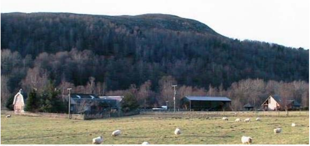
Fig. 2 : Prony Farmhouse (left) and the newer property, Pronybeg (right)

3. At the time of permission being sought for the new dwelling house in 1995, the agricultural landholding of which the proposed site formed part extended to approximately 675 acres and supported a flock of between 300 and 400 breeding ewes. Of the overall 675 acre landholding, 500 acres was leased from Dinnet Estate.